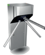
TL1 Stainless steel