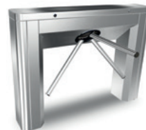
TL2 Stainless steel