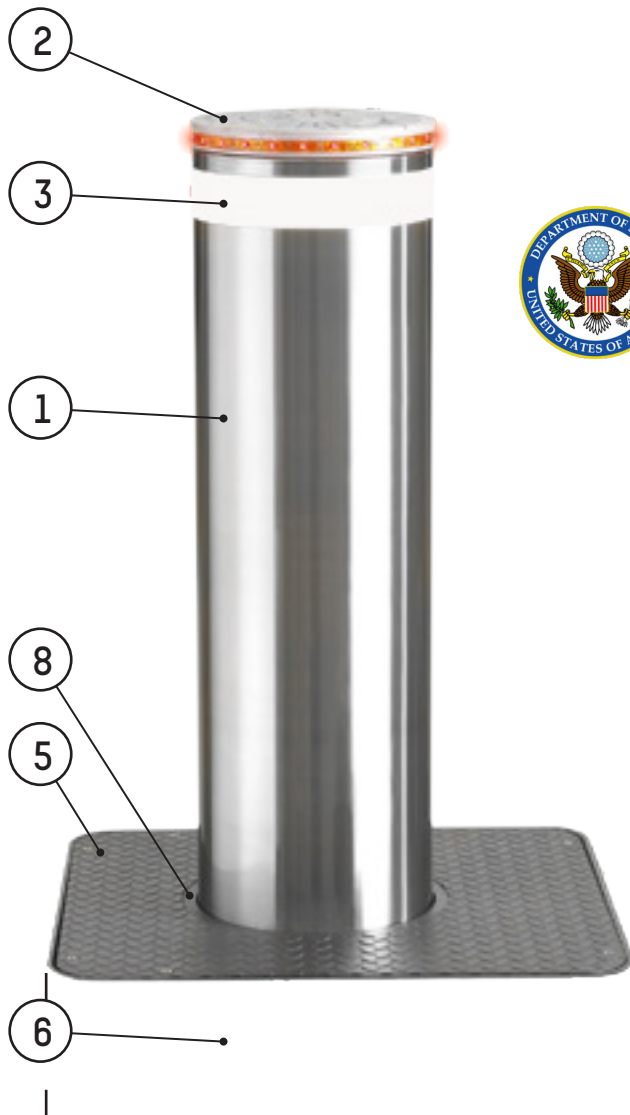
RB M50 illustré avec borne en acier inoxydable en option.

The RB M50 High-Security automatic rising bollard is designed to protect and control access to sites that are susceptible to attempted break-in.