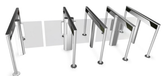
1. Handrail frame: steel beam with RoHS anti-corrosion zinc plating treatment and stainless steel posts. The handrail includes photoelectric cells for user detection and the logic control board.

The SlimLane 944 is a modular product that can be installed as a single or a multi-lane array by combining with the SlimLane 945 Twin dual compact lane, the SlimLane 940 standard lane and SlimLane 950 wide lane models.