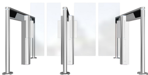
SL 940 + SL 950

The SlimLane 940 is a modular product that can be installed as a single or a multi-lane array and can also be combined with the SlimLane 950 standard lane model. It can also be completed with a service lane.