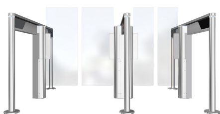
SL 950 + SL 940

The SlimLane 950 is a modular product that can be installed as a single or a multi-lane array and can also be combined with the SlimLane 940 standard lane model. It can also be completed with a service lane.