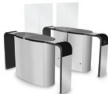
SmartLane 912 with Enhanced Entrance/Exit Control Footprint*: 2000 x 1800 mm (78 3/4 " x 70 7/8 ")