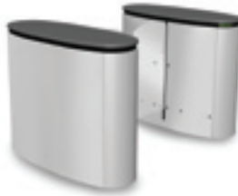
SmartLane 910 Footprint*: 1200 x 1800 mm (47" x 70 7/8 ")